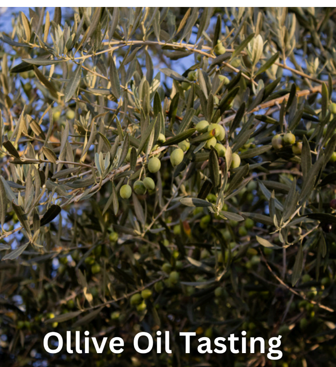
Ollive Oil Tasting