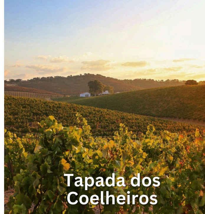
Tapada dos Coelheiros