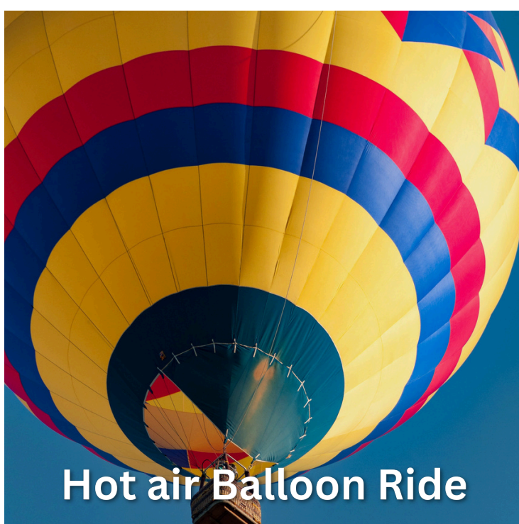
Hot air Balloon Ride