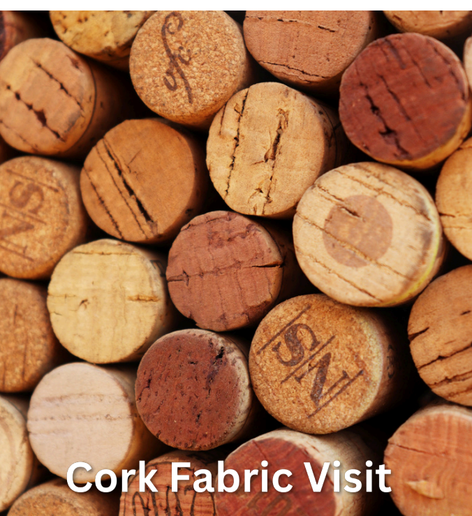
Cork Fabric Visit